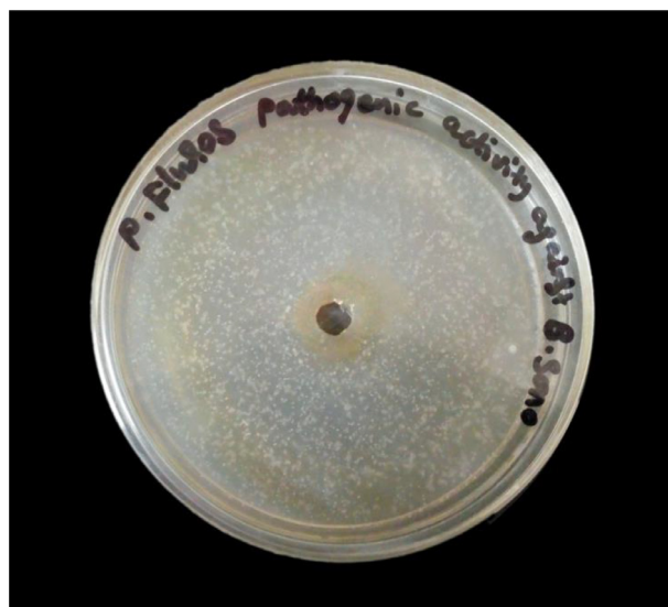
c Antagonistic activity against