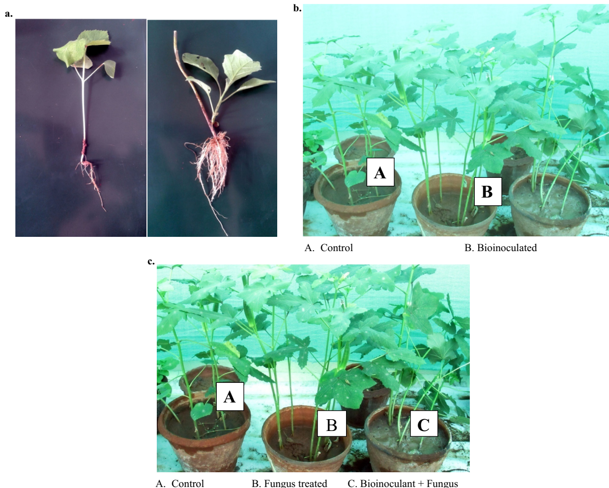
Fig. 1a. Root length of Abelmoschus esculentus after treatment of Bacillus sonorensis . b. Growth of Abelmoschus esculentus was observed at 60 days after treatment of Bacillus sonorensis . c. Biocontrol activity of Abelmoschus esculentus against Aspergillus niger .

The carotenoid content of A. esculentus was determined for bioinoculated and control plants. In the present investigation, amount of carotenoid (0.445 mg) was predominantly high in bioinoculated plants than control plant (Table 1d).