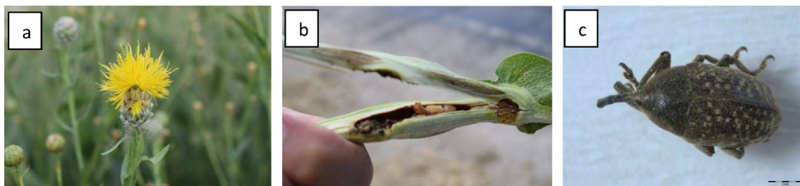
Fig. 3. Centaurea behen (a) infested with the larvae of Larinus grisescens (b,c).