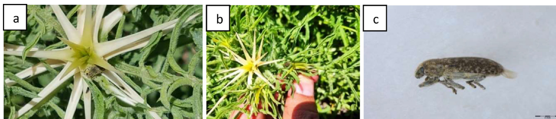
Fig. 5. Centaurea iberica Trev. ex Spreng. (a, b), Bangasternus orientalis (Capiomont, 1873) (c).