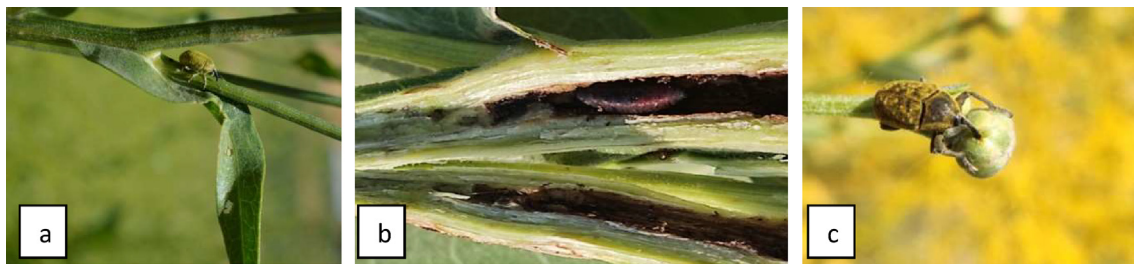
Fig. 4. Centaurea pterocaula (a) infested with the larvae of Larinus grisescens (b,c).

New host record: In the present study, Centaurea behen was recorded as a new host of Larinus grisescens from Hakkari/Turkey for the first time in the world (Fig. 3).