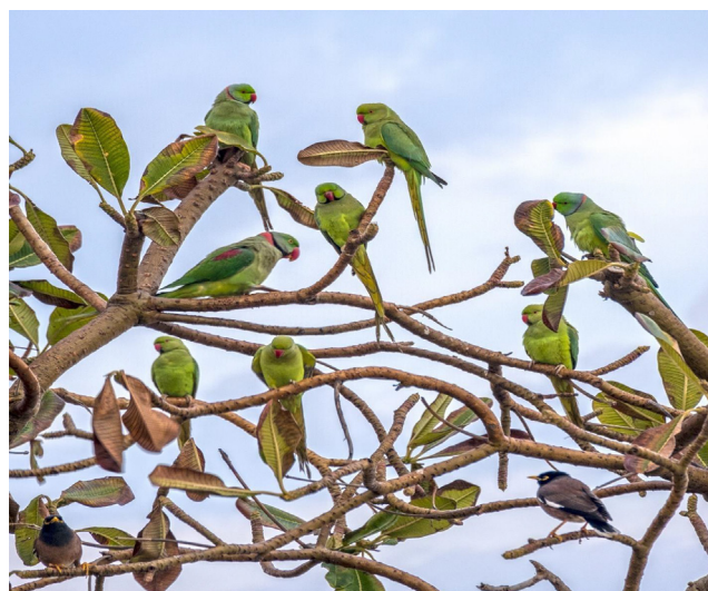
Fig. 2. Introduced species in Ras Tanura, Eastern Province. The Alexandrine Parakeet, Ring-necked. Parakeet and Common Myna seen on the same tree.

tion in Bank Myna numbers and distribution is because of the unparalleled success of the Common Myna (Fig. S1.14). The latter was first recorded successfully breeding in the Eastern Province in late 1970 (Bundy and Warr, 1980). In 1993, six pairs were recorded breeding at King AbdulAziz University in Jeddah (Felemban, 1993). Currently, the Common Myna is seen in almost all cities in the Kingdom after its latest spread in the southwest to Jizan (Jennings, 2010). Most numbers are seen in developed shore-