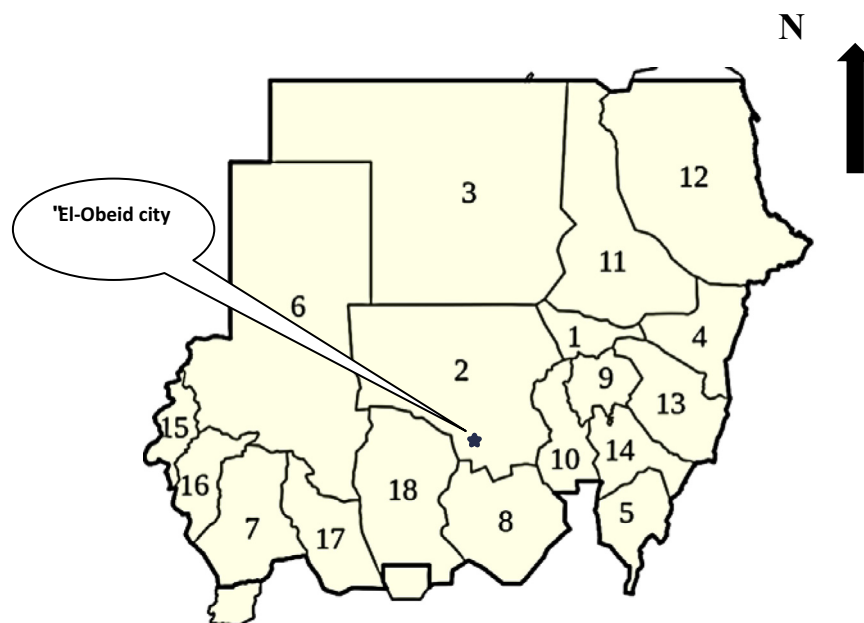
Figure 1 Location map of Northern kordofan, Sudan. 1: Khartoum state; 2: North Kordofan state; 3: Northern state; 6: Northern Darfur state; 8: South Kordofan state; 10: White Nile; 18: East Kordofan.

Collected as colorless crystals (20 mg) by repeated crystallization of the residue obtained from fraction A 3 ; m.p. 200–202 °C. UV/VIS data are shown in Table 1. IR (KBr) cm -1 : 3552 (OH), 1616 (C=O), 1521. 1 H-NMR (Acetone-d 6 ), δ: 7.40 (2H, m, H-2'/6'), 6.89 (2H, m, H-3'/5'), 6.01 (1H, s, H-8), 4.64 (1H, d, J = 11.6 Hz, H-3), 5.06 (1H, d, J = 11.6 Hz, H-2), 5.23 (1H, m), 3.26 (2H, d, J = 6.8 Hz), 1.75 and 1.64 (s each, all -CH 3 ). 13 C-NMR (Acetone-d 6 ), δ: 83.7 (C-2), 72.5 (C-3), 161.3 (C-5), 108.7 (C-6), 164.6 (C-7), 94.8 (C-8), 158.2 (C-9), 130.8 (C-2'/6'), 115.2 (C-3'/5'), 158.1 (C-4'), 17.2 (CH 3 , C-4''), 25.2 (CH 3 , C-5'''), 122.7 (CH, C-2'''), 20.9 (CH 2 , C-