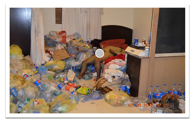
Fig. 4. Scene of corpse number 10 showing a lot of waste materials in the apartment.

these corpses. Results show that, majority of cadavers were found in all season months except summer. Some bodies attracted a high number of insect species and number such as case 3 which discovered in January 2017 attracted the 3 species and 102 insects (39.5%), and the two cadavers found in March 2018 (cases 7 and