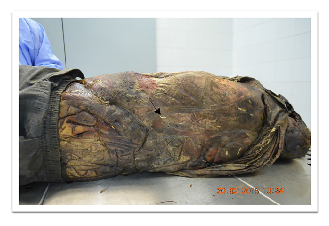
Fig. 1. Corpse of the outdoor case 2 in the morgue indicating some insect larvae (Arrow).

and the beetle, Dermestes maculatus DeGeer in 4 and 3 of the corpses, respectively (Table 2).