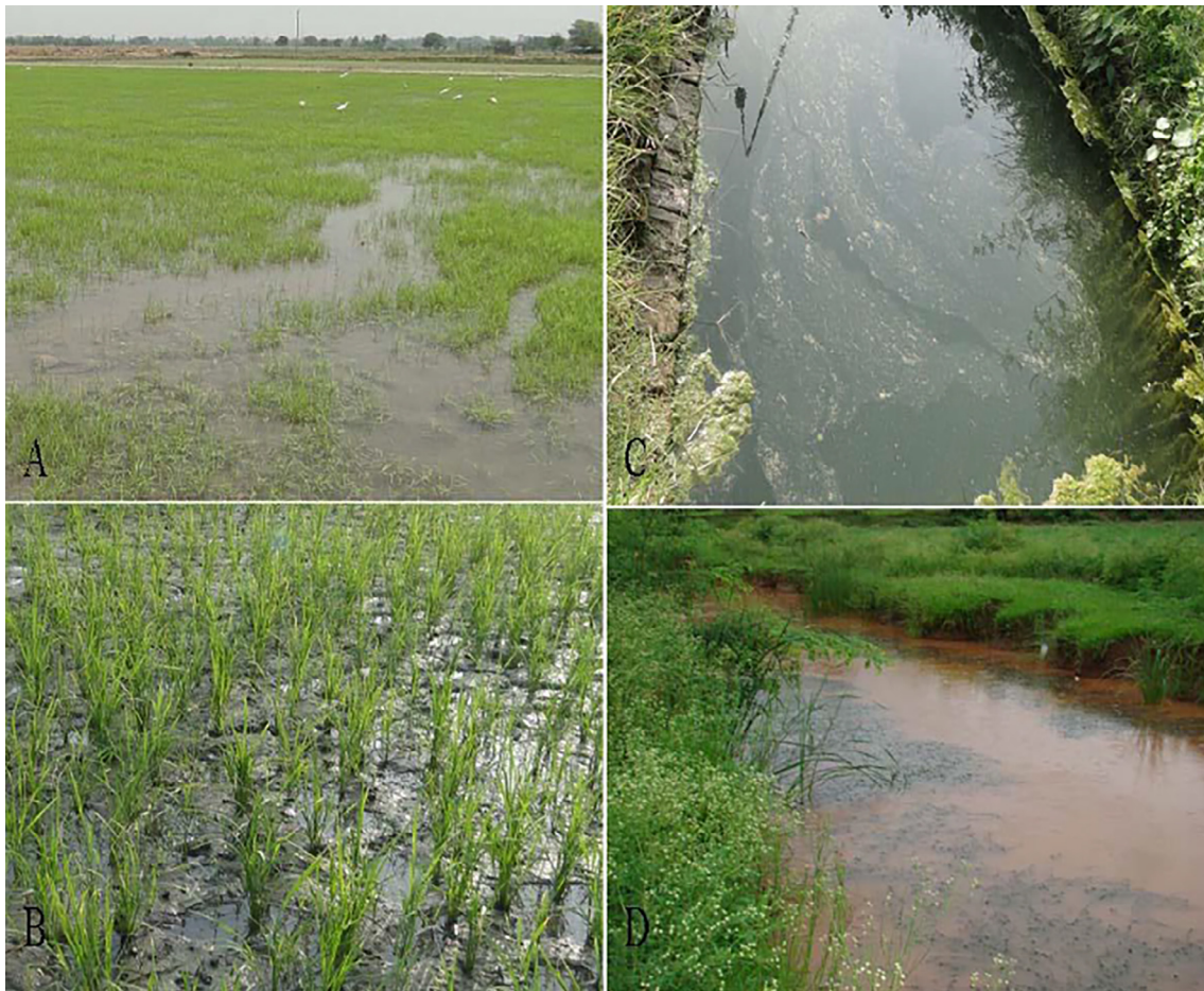
Fig. 1. Paddy Fields in Gujranwala, Punjab, Pakistan (A&B); Urban Wetlands: Pond near tube well at PMAS Arid Agriculture University Rawalpindi (C) and irrigation canal (D) at Rawal Lake, Islamabad.

The areas of Rawalpindi-Islamabad experience a humid sub-tropical climate with long and very hot summers, a short monsoon