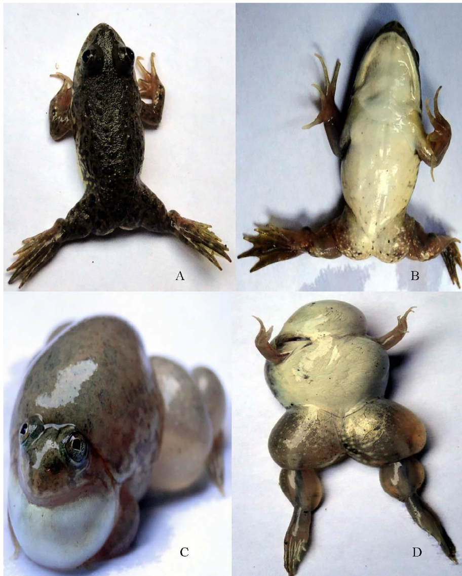
Fig. 4. Specimens of Common Skittering Frog ( Euphlyctis cyanophlyctis ) showing limb deformity (A, B) and gas bubble disease (C, D).

We compared means of morphometric and gravimetric measurements of male/female from paddy fields and urban wetlands using student's t-test ( \alpha = 0.05 ). We run multivariate generalized linear model (one-way MANOVA) to examine if there were any differences ( \alpha = 0.05 ) between categorical independent variables i.e. sex (male and female frogs) or site (paddy fields and urban wetlands) on continuous dependent variables (24 morphometric and three gravimetric measurements). We used slope (scaling coefficient) of regression equation ( \log BW = b + \log SVL * a ; BW = Body weight, SVL = Snout-vent length, b = slope and a = intercept) to compare growth rate of the frogs from paddy fields and urban wetlands. We also conducted linear regression to compare relationship between body weight ( \log ) and liver ( \log )/kidney weight ( \log ) of the frogs. We performed all statistical tests in SPSS 22.0. We followed Meteyer (2000) to identify and classify deformities and abnormalities in the specimens.