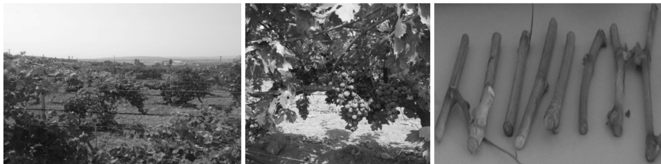
Fig. 1. View of vineyard area, Okuzgozu grape variety and grapevine canes.

The analysis of variance (ANOVA) approach was used to examine