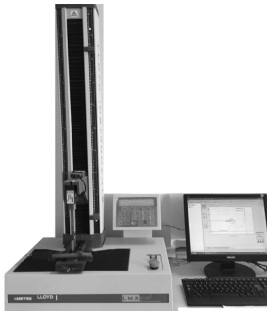
Fig. 2. The Lloyd LRX plus materials testing machine and cutting blade.

where: F_{max} is the max. cutting force (N), \sigma_s is the max. cutting strength (MPa), A is the cross-sectional area (mm 2 ).