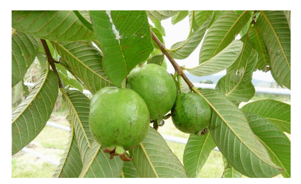
Fig. 1. Plant leaves picture of P. guajava.

The analyses of the isolated leaves oil were performed using a sensitive Perkin Elmer gas chromatography-mass spectrometry (Model: Clarus 600) which was equipped with a capillary silica column (HP-5MS; 30 m \times 0.25 mm i.d. \times 0.25 \mu m film thickness). The program of the injector, transfer line, and ion source were set at 290, 260 and 260 °C, respectively. The oven temperature was from 50 to 280 °C at 3 °C/min and then held isothermal for 10 min. and finally raised to 280 °C at 5 °C/min. As the carrier gas, inert gas (Helium, purity 99.9999%) was used with a flow rate of 1 ml/min.