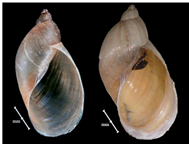
Fig. 1b. Snail shell samples were examined by the binocular microscope.

tated in the sediment instead of dissolving in water (Table 5), where sediments are important sinks for numerous pollutants such as pesticides and heavy metals. Also, sediments play an extensive function in remobilizing contaminants in aquatic systems under favorable situations and in water–sediment interactions (Hyun et al., 2007).